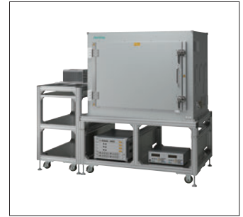
RF Chamber MA8171A

Архангельск (8182)63-90-72 Астана (7172)727-132 Астрахань (8512)99-46-04 Барнаул (3852)73-04-60 Белгород (4722)40-23-64 Брянск (4832)59-03-52 Владивосток (423)249-28-31 Волгоград (844)278-03-48 Вологда (8172)26-41-59 Воронеж (473)204-51-73 Екатеринбург (343)384-55-89 Иваново (4932)77-34-06