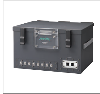
Shield Box MA8161A