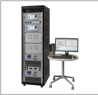
LTE-Advanced Mobile Device Test Platform ME7834LA