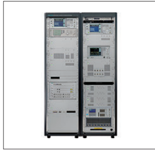
New Radio RF Conformance Test System ME7873NR