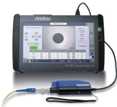
Available for MT1000A and MT1100A *Shown with MT1000A