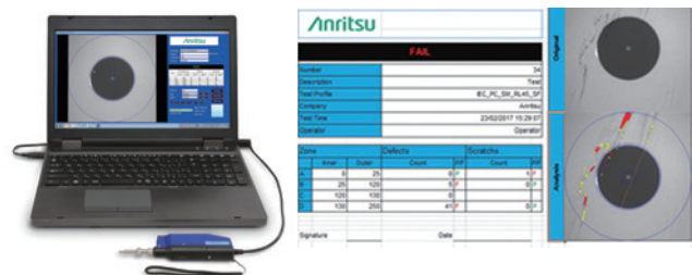
Easy report generation on a PC using MX900031A.

* Operation Manual and Autofocus VIP Software (For PC) MX900031A available from the Anritsu public Web site.